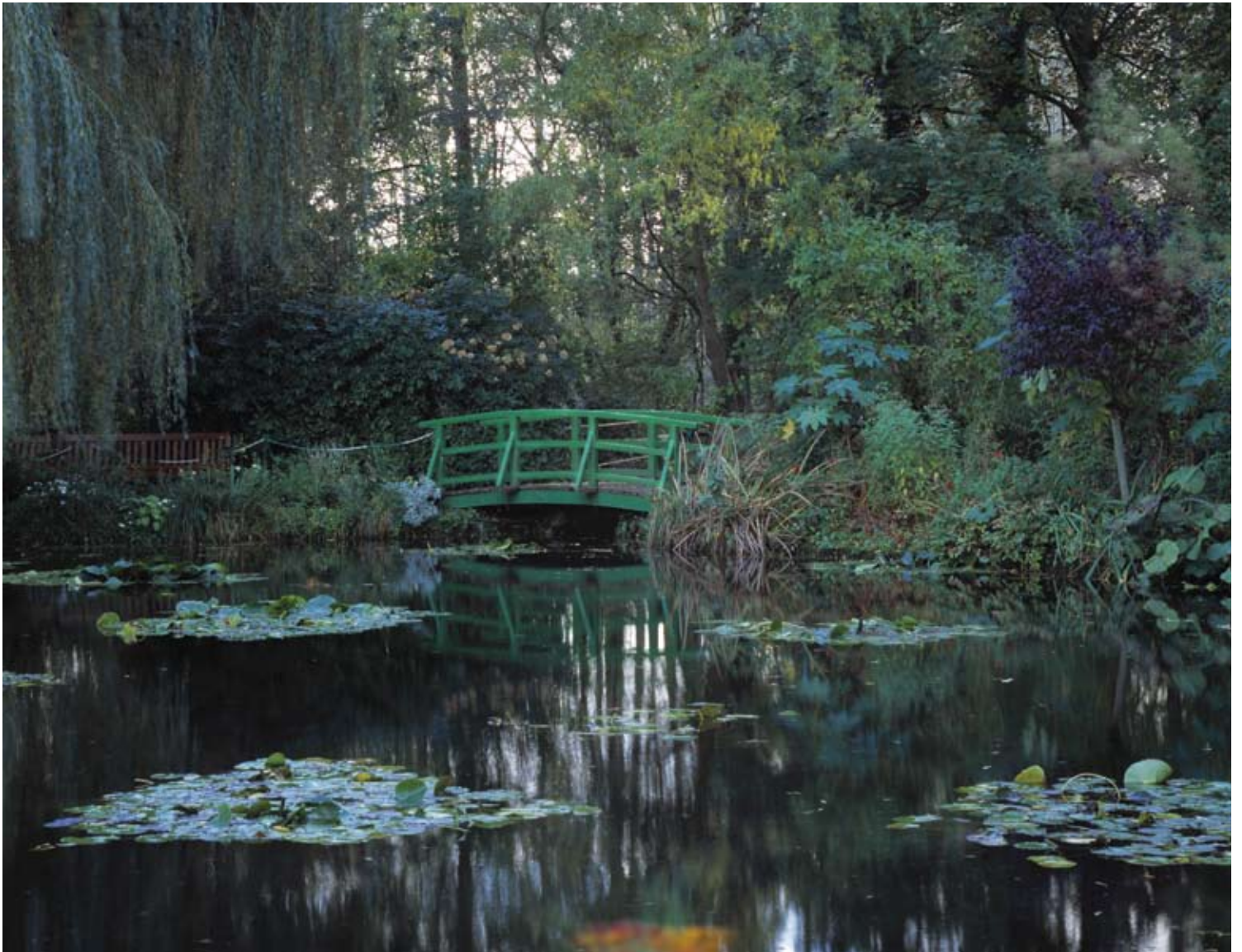
A bridge at the village of Giverny, France, where Monet painted.

For more information, visit www.monetspalate.com